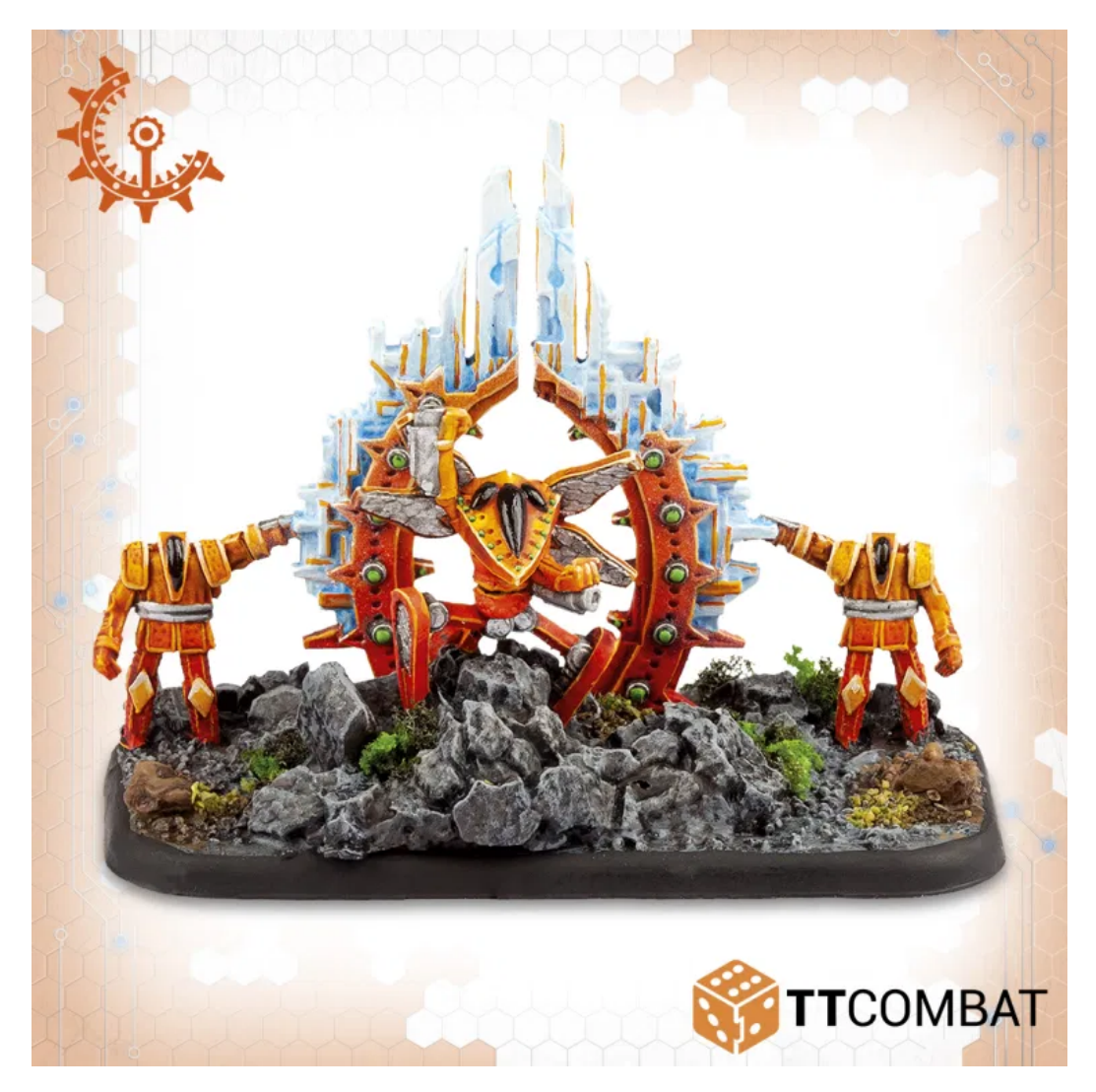
Here the Daimyo is, to totally ruin your enemies plans.

At first glance the Daimyo is not very well armed, 4 shots, energy 3 in CQ and nothing else is, well, poor. However, if he causes a single point of damage against a squad in a garrison, he can immediately move that squad out of the garrison into the great outside. If you have some anti-infantry weapons set up out there, well that's just some happy coincidence I'm sure.